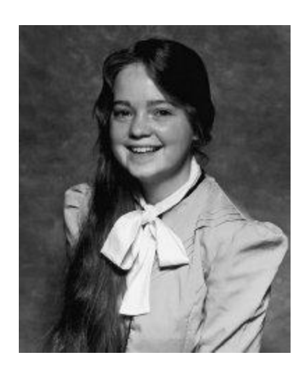
Here I am at fourteen.